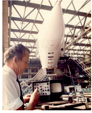
CONCORDE program UK-1960

Ultrasonic Non-Destructive Testing (NDT) has helped engineers inspect all sorts of composite materials for years. Whether it be traditional aluminum laminates or today's more complex carbon fibre-based composites, ultrasonic NDT technology has the ability to acoustically see through these parts and create complete inspection maps. Comprehensive volumetric integrity reports can be generated and supported by imaging reports that are as easy to interpret as traditional X-Ray.