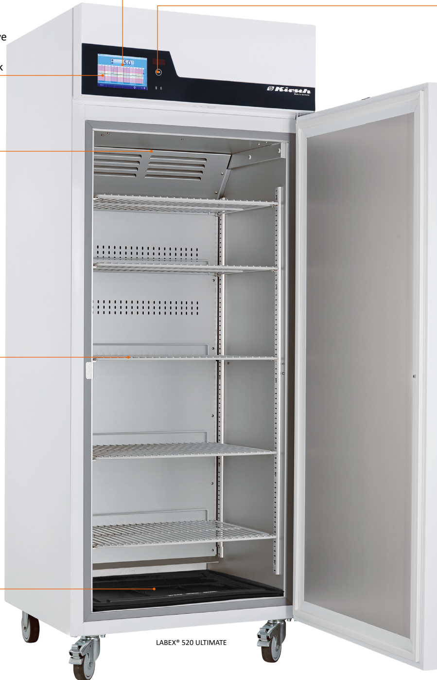
LABEX® 520 ULTIMATE